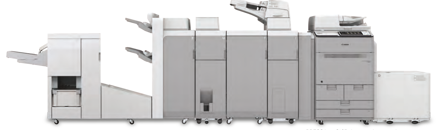
imagePRESS Lite C165 shown with optional accessories.

From professional punching to folding and saddle-stitching, you can have the ability to satisfy more people and keep more in-house.