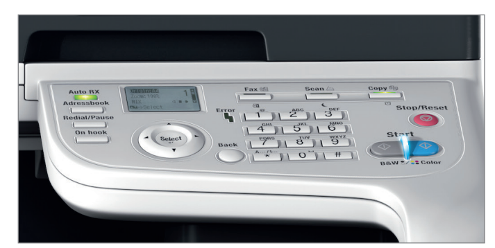
4 lines LCD-display with easy access to function keys and operator console

STANDARD RADF, STANDARD DUPLEX, STANDARD NETWORK, PRINTING AND SCANNING WITH OPTIONAL FAX FUNCTION REAL 1200 X 1200 DPI PRINTING RESOLUTION (REDUCED SPEED) PAPER CAPACITY UP TO 850 SHEETS (WITH OPTION) ENHANCED USER AUTHENTICATION AND SECURITY SETTINGS EXCELLENT ENERGY SAVING THANKS TO REDUCED POWER CONSUMPTION (SLEEP < 3W) 1 GB RAM STANDARD MEMORY EXPANDABLE UP TO 2 GB OPTIONAL IC CARD READER AND 320 GB HARD DISK