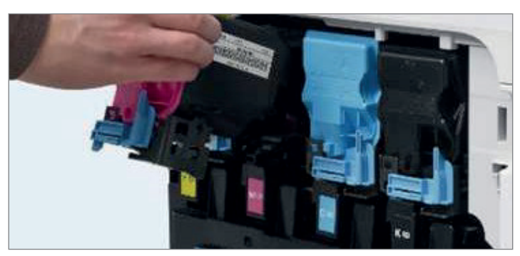
Easy access for toner cartridge replacement