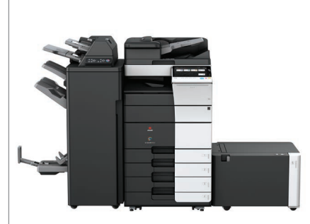
Configuration with SF-537SD Finisher, PI-507 Post-Inserter, RU-513 Connection Unit, PC-215 Drawers, LU-207 Side Drawer