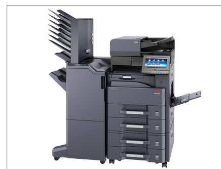
d-Copia 3502MFplus full configuration