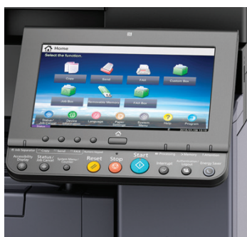
9" Colour Touch Panel display