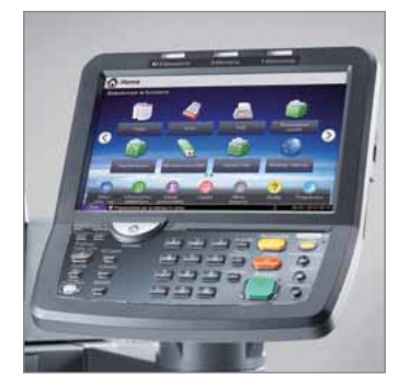
Tiltable operator panel, 10.1" touch screen

Technology for excellent communication. The broad 10.1" touch screen on this product line can be raised and tilted, for maximum flexibility in creating a personalised solution. The swipe functions , similar to those on a mobile device, make use of the display even easier. Accessibility is also guaranteed by the optional wireless network interface and on-the-move printing from smartphones and tablets.