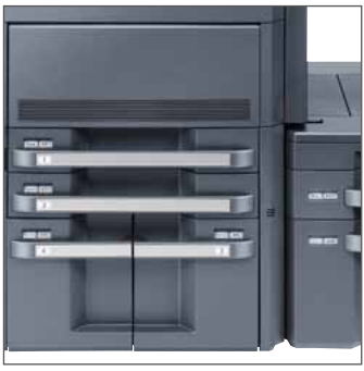
Max. paper tray capacity 7,650 cut sheets (7 trays + bypass)