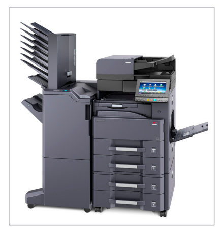
d-Copia 3201MF (or d-Copia 4001MF) + DP-7110 + PF-791 + DF-7110 + AK-740 + MT-730(B)