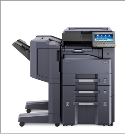
d-Copia 3201MF (or d-Copia 4001MF) + Platen Cover (E) + PF-810 + DF-7120 + AK-740